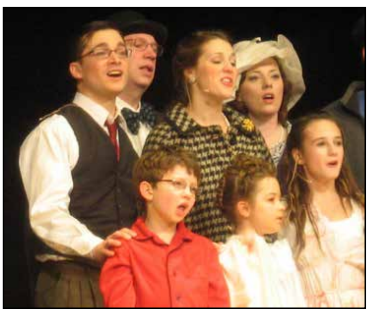
IT'S A WONDERFUL LIFE!

STONE ARCH PLAYERS P.O. Box 604 Lewistown, PA 17044